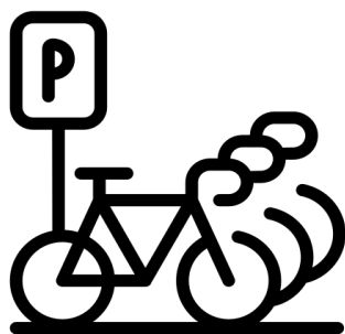
SECURED BIKE STORAGE